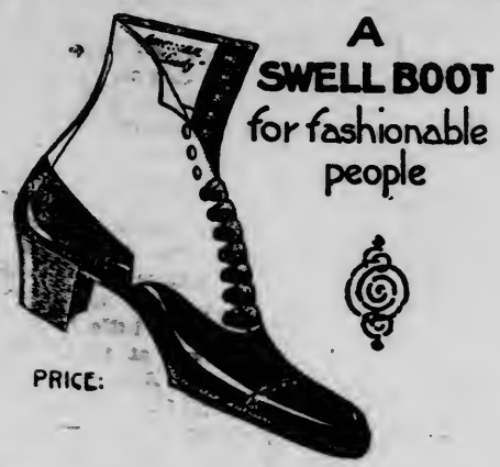
A SWELL BOOT for fashionable people

W. L. DOUGLAS and THE BROWN SHOE CO. are, without a shadow of a doubt, the worlds' two greatest Shoe-makers. Desirous of giving our customers the best there is to be had, we are showing both of these great lines. When it comes to a big Stock. Quality and Price, WE TAKE OFF OUR HATS TO NO MERCHANT IN ROCKCASTLE COUNTY.